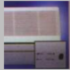
Self-diagnosis and Auto-protection