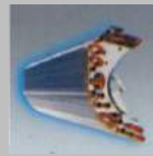
3 or 4-Bend Heat Exchanger