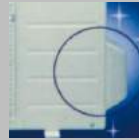
Valve Protection Cover