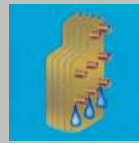
Gold Fin Condensor