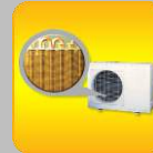
Gold Fin Condenser