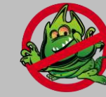
Multilayer dustproof filter