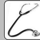
Self-diagnosis and Auto-protection